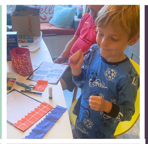
Children signed up