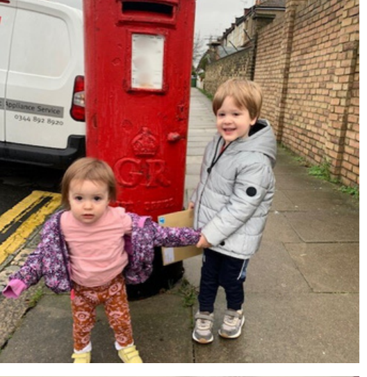
LOOK FORWARD EVERY MONTH TO RECEIVING MY PICTURE FROM NOA AND SHOWING THEM TO MY WIFE WHEN SHE VISITS